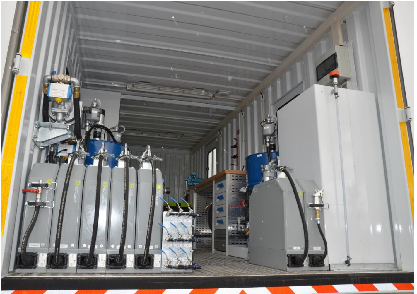
View inside of the workshop container. Left-hand side 5 hose reels. Right-hand side : 2 hose reels and water tank.