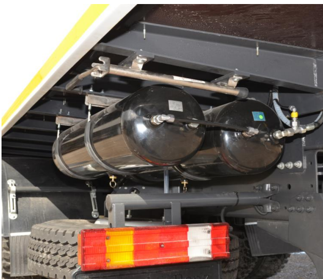
Two additional air tanks mounted underneath the workshop container body. Left-hand side.

Air compressor mounted in lockable protection box.