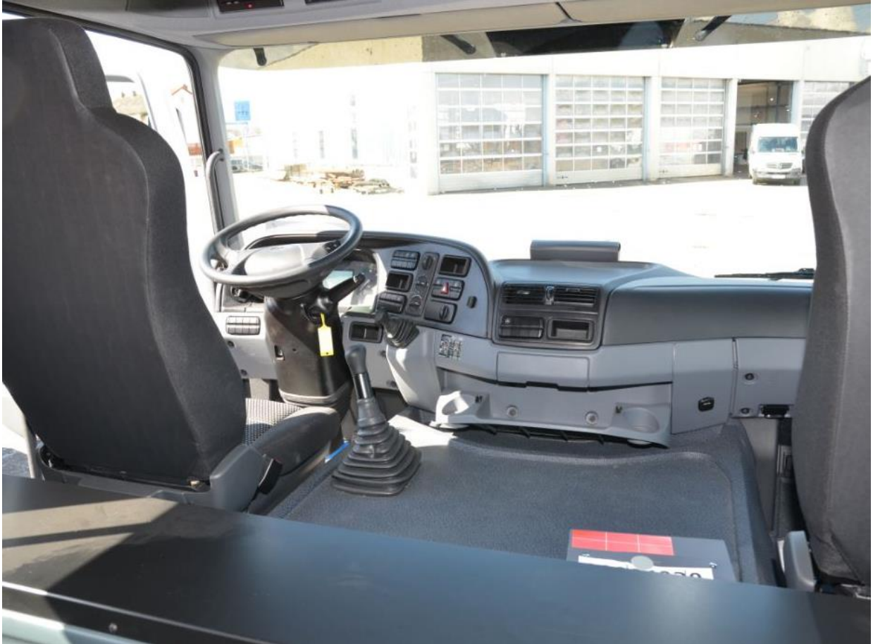
Inside view of drivers cabin: Very large double cabin.