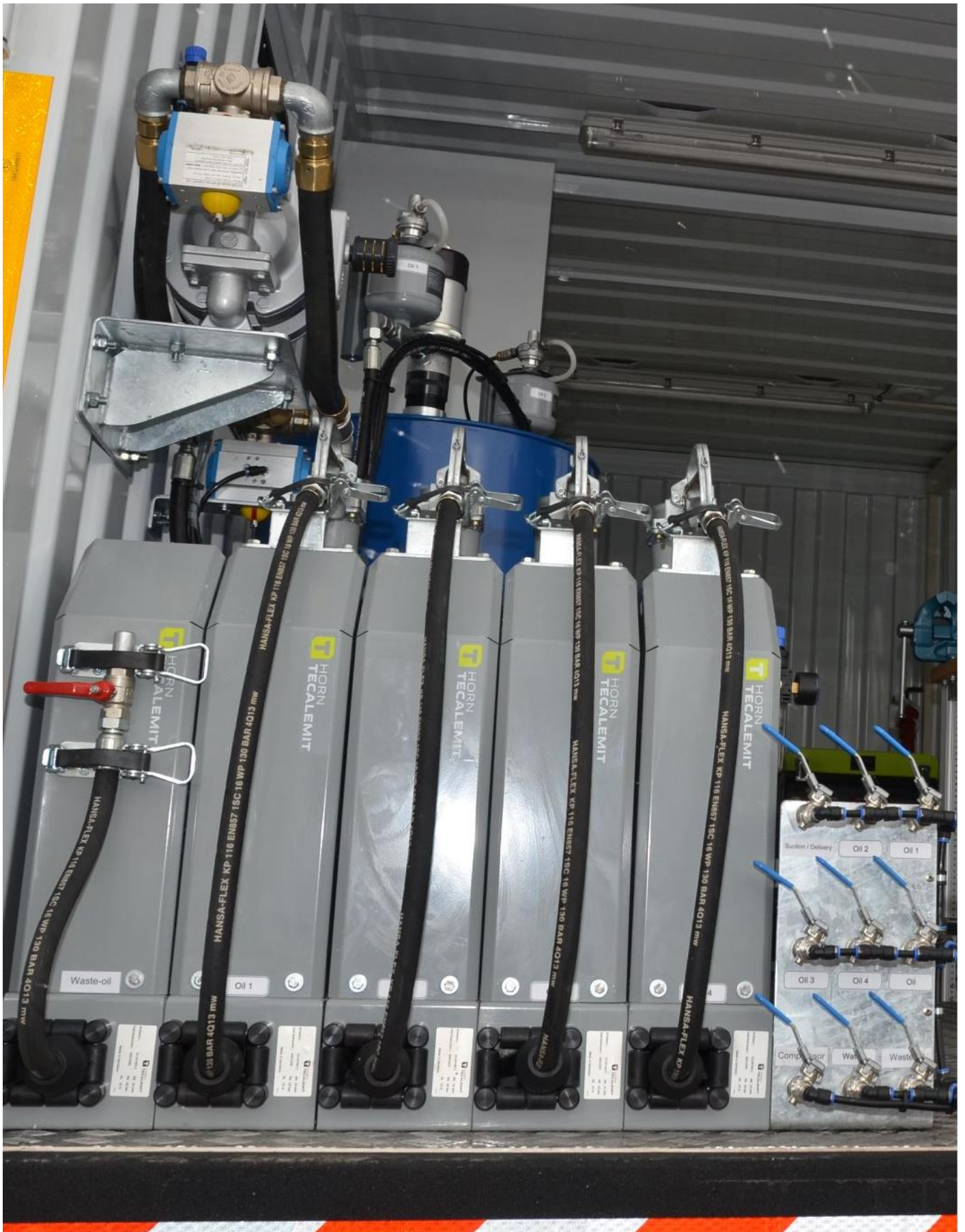
Leftmost: 1x hose reel for safe suction of waste oil. Above that (left, on metal base) self-priming waste oil pump. Middle: 4 x hose reels for different kind of oil. All TECALEMIT hose-reels with 15m hose, integrated flow-meter and discharge nozzle.