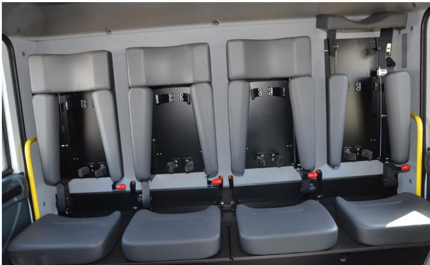
Comfortable drivers double cabin with totally 6 seats and a lot of room.

This special workshop & lubrication truck can be mounted on truck chassis of the following manufactures: