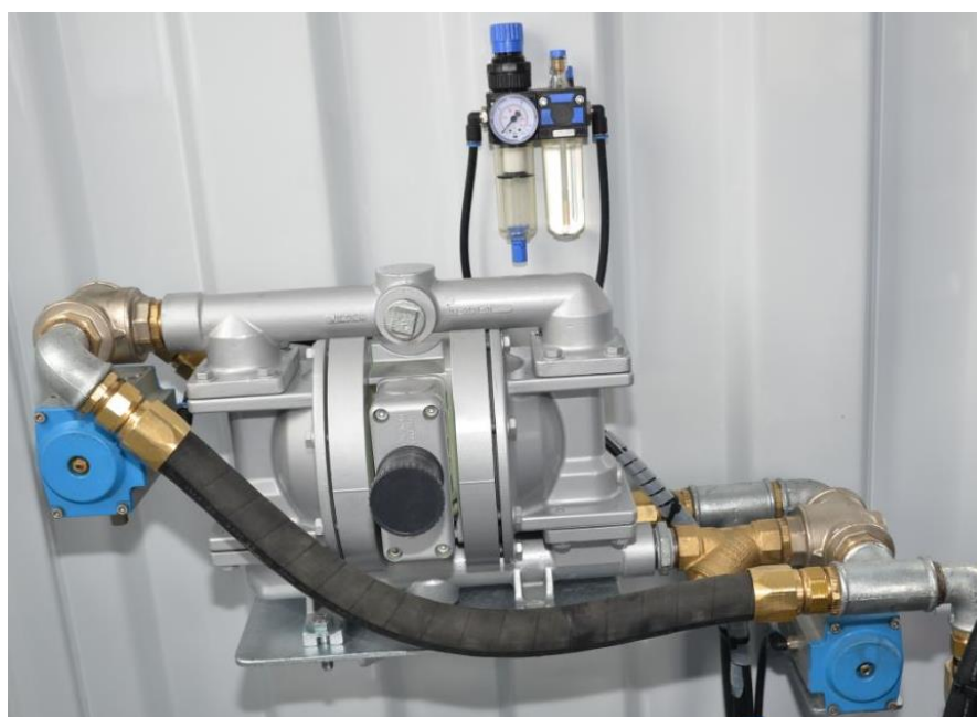
View of the self-priming waste oil pump.