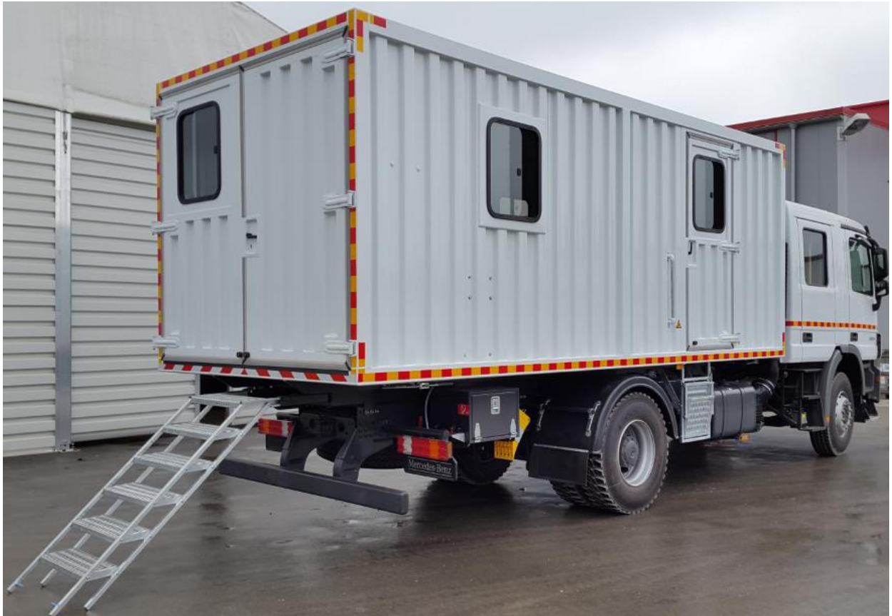
Winged rear door. Opening 270 degree. To be opened from in- and outside. Folding stairs, retractable, made of hot-dip galvanized steel for easy access.