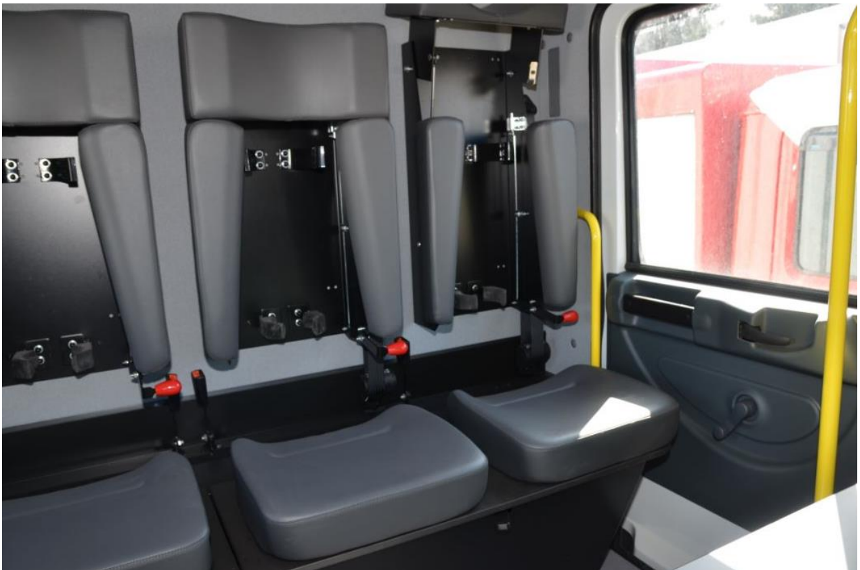
Equipment boxes with much storage space under the 4 rear seats