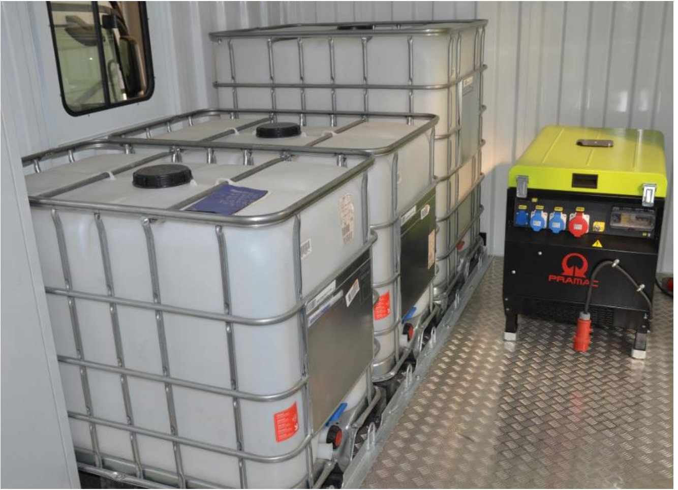
1 x oil bulk container 1000 ltr. (behind) for waste oil and 2 x oil bulk containers à 640 ltr. for different kind of oil