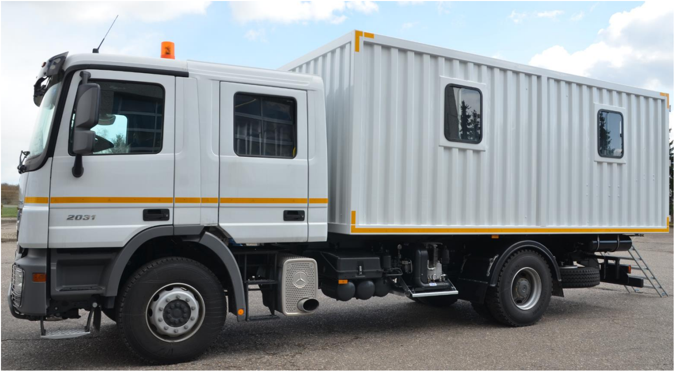
The truck mounted workshop and lubrication unit offers a universal support for various maintenance, repair and service works