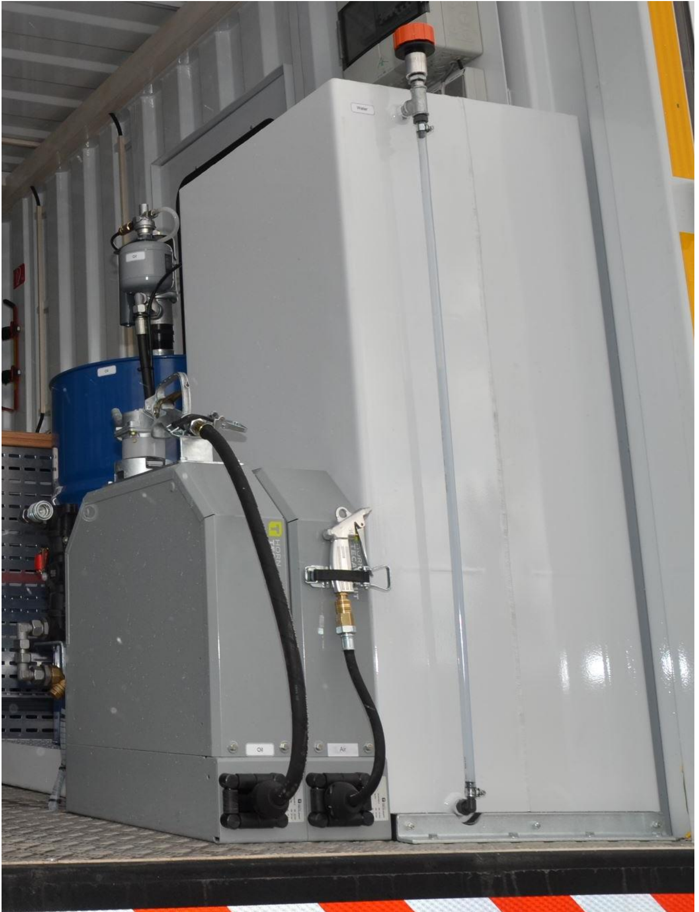
1 x TECALEMIT hose reel for 250 ltr. steel oil tank (behind, blue). 1x hose reel with air hose and air pistol. Rightmost: 400 ltr. water tank (white), it can be used for water or coolant. Water supply by separate hose ½" x 15m with spray-nozzle.