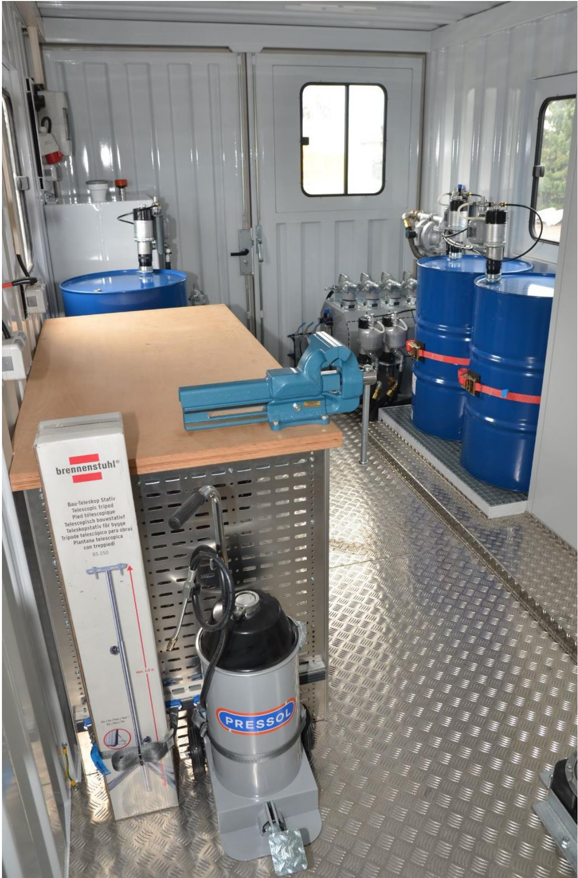
Overview of the workshop container with foot grease pump and workbench in front and 4 steel tanks for oil and water. The closed container door behind.