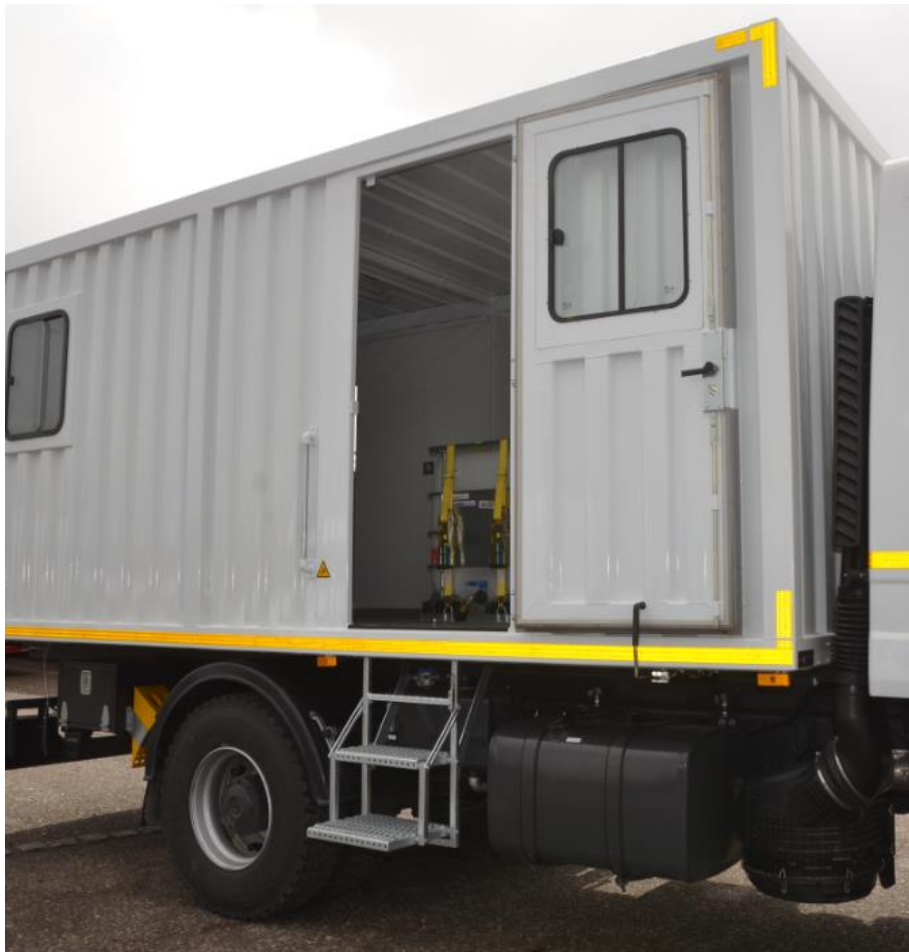
Winged side door on right-hand side of the body with opening 180 degree.