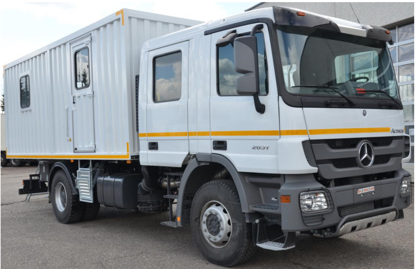
Container body execution: Heavy-duty made of corrugated steel panels, strongly welded together with inner coating.