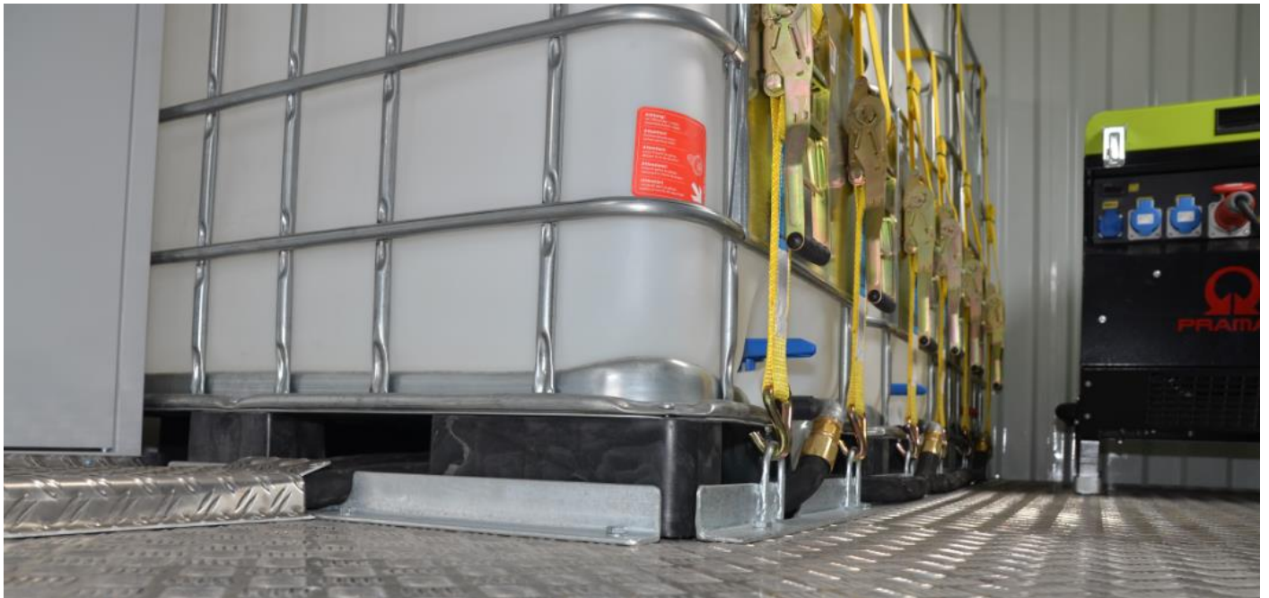
All supply pipes for oil are well protected under corrugated sheet metal (easy removable).