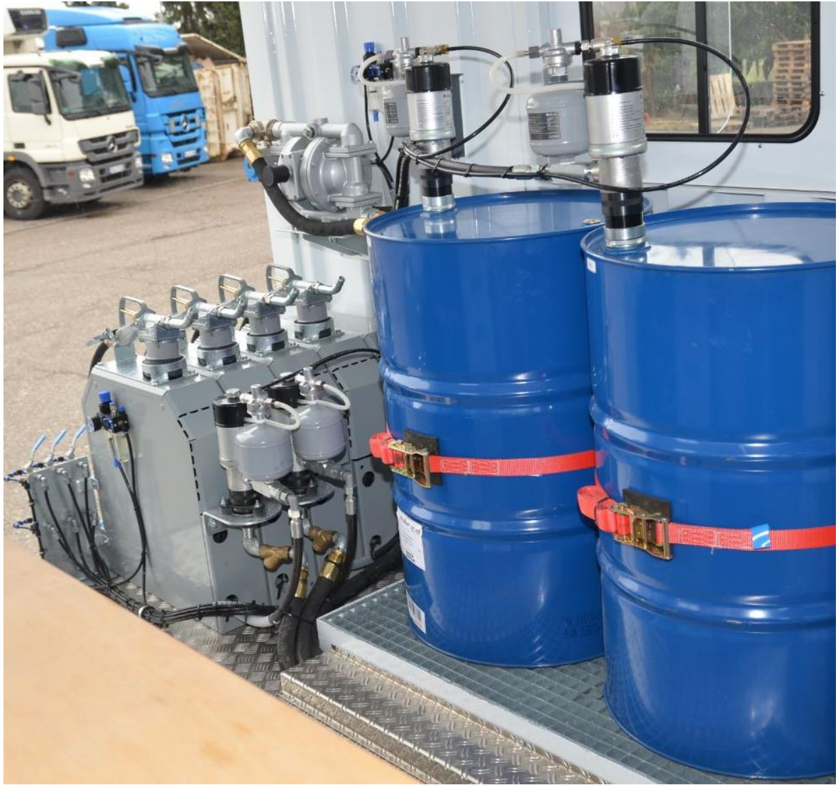
2x 250 ltr round steel tanks for oil. Before them the TECALEMIT unit with 5 x hose reels and waste-oil pump.