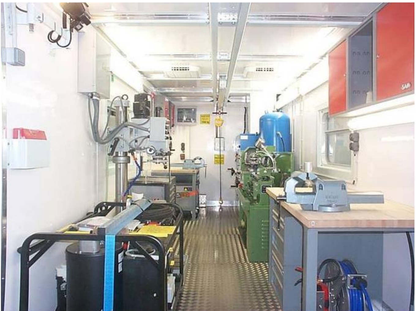
Example: Insulated workshop container (A/C) with turning lathe machine, crane etc.